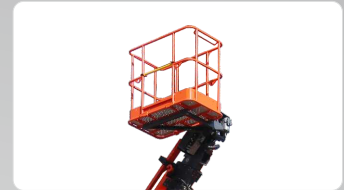
Aerial work platform operation