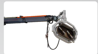
Rust removal operation