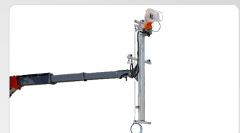
Spray painting operation