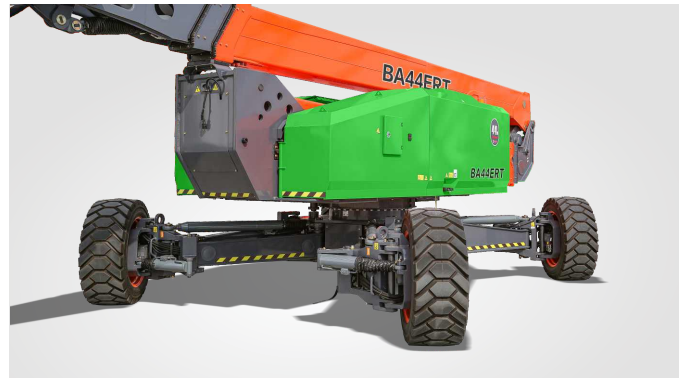
Brand New One-Key In-Situ Axle Expansion Technology Global Patent Protection